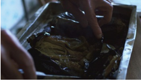
Mary Jirmanus Saba Notes for a Return 14:05 (Lebanon/ U.S.A.)

The film is an experiment in a slow cinéma engagé : to film the ordinary moments after the revolutionary event has failed to achieve its goals. The slow daily lives of a couple living far from one another, far from their dreams of revolutionary change. The film takes inspiration from Japanese Avant-Garde landscape cinema: proposing revolutionary cinema should show the everyday landscapes of oppression and human resilience. It incorporates Adachi and Wakamatsu's 1974 propaganda film Red Army/PFLP: a Declaration of World War . Neither nostalgia nor flashback, the archival past exists within the characters' everyday lives.