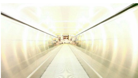
Ayman Alazraq Oslo Syndrome 06:30 (Norway)

Starting from data-bending; video art in the city is understood as a complex and constantly changing system of deconstruction. Using visual noise (glitching) as the mode of fragmentation, and creating a new vision of the landscape from the error, the noise and interference proposes to generate visual simulations of the decline, destruction and transformation of the structure of a city.