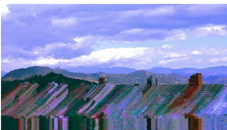
Andres Cuartas Deconstructions 03:01 (Colombia)

Crossings explores the experience of sub-Saharan migrants who embark on the perilous journey to reach the elusive shores of Europe. The video installation focuses on the collective trauma provoked by the embodied experience of crossing boundaries and becoming a fragile community in a new habitat. While grasping the experiential textures of psychological and physical transition, the installation also gestures towards the concept of Europe as a problematic utopia in the collective African imagination.