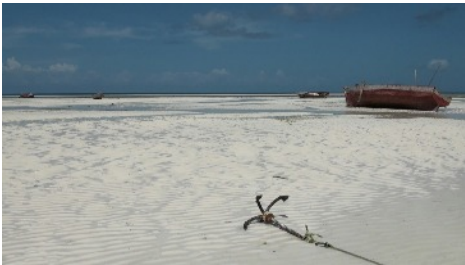
Zafer Topaloglu Feel this moment 09:40 (Turkey/ Tanzania)

'This land was made for you & me' is the refrain to Woody Guthrie's song 'This Land is Your Land'. The song is taught to children and sung throughout the USA and the world, but Guthrie's radical intent, to protest private property, is often covered up or forgotten. Our video You & Me was produced by rubbing a cellphone against chainlink fences, barbed wire, and other barricades throughout New York City. The piece applies the surrealist tactic of frottage , the rubbing of objects to uncertain results, to new media and sound art. The results are visuals that distort the space of the city accompanied by clattering noise. The violent results remind that fences are not mere objects, but a social relation between the powerful and the less powerful. Fences are a form of violence meant to maintain inequality. Much like Guthrie's song, we consider You & Me to be a protest against private property. When we imagine any sense of home, we imagine a land without fences.